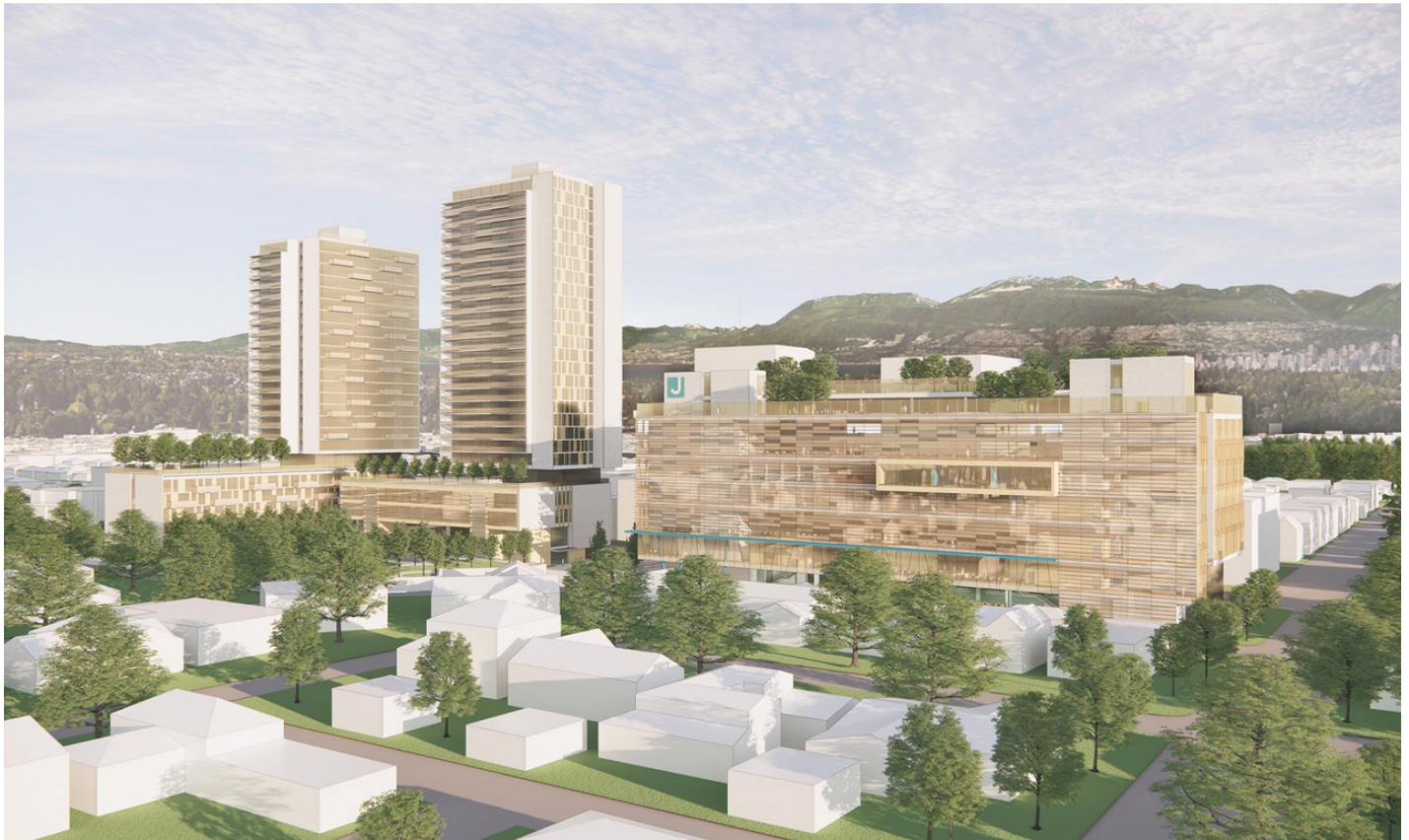
A rendering of the JWest project

Gain a fresh perspective on career development.