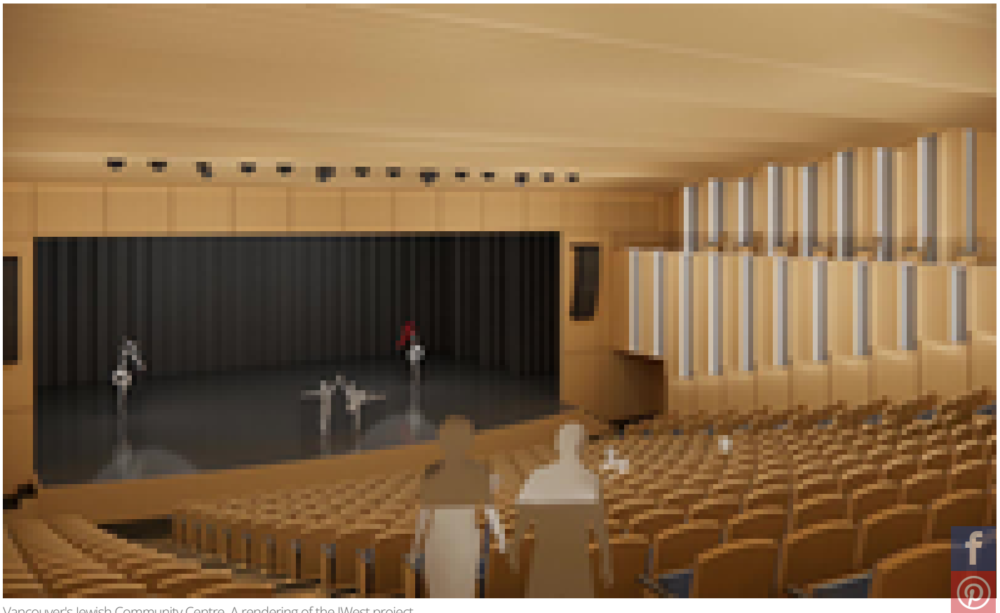
Vancouver's Jewish Community Centre. A rendering of the JWest project

It was around seven years ago that the JCC started looking into redevelopment opportunities. But as demand grew, the Jewish Federation came on board, and the JWest project expanded to include a mixed-use residential area. It also decided to bring King David High School under its umbrella, which was at capacity.